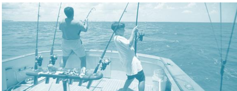
Recreation South Australia